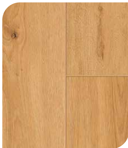
Befort (RF) 57035