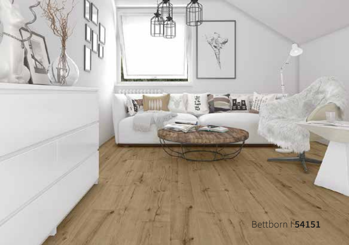
Bettborn | 54151