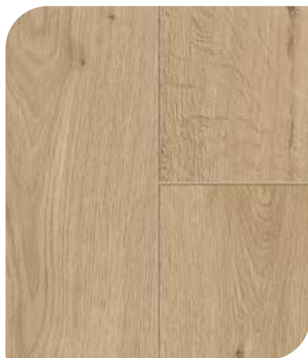
Waldhof (RF) 54149