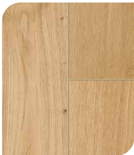
Clervaux (RF) 54147