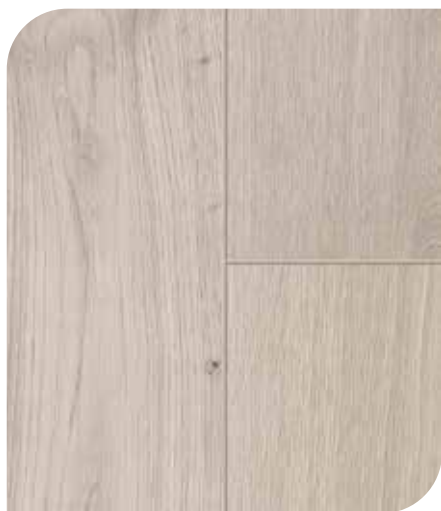
Mondorf (RF) 54148